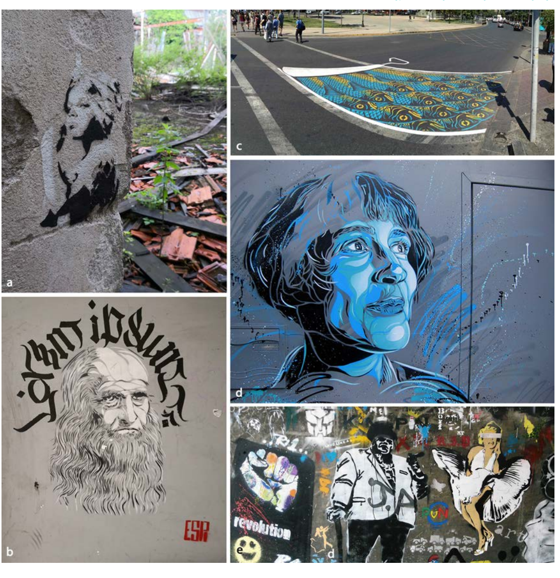
Fig.9- a) Stencil by anonimous, Cartiera in Cairate; b) Stencil and lettering by anonimous at Porta Genova, Milano; c) Roadsworth's stencil; d) C215's stencil, Vitry-sur-Seine, France; e) Roadsworth composition of stencil at Cans Festival curated by Bansky, London, 2008.