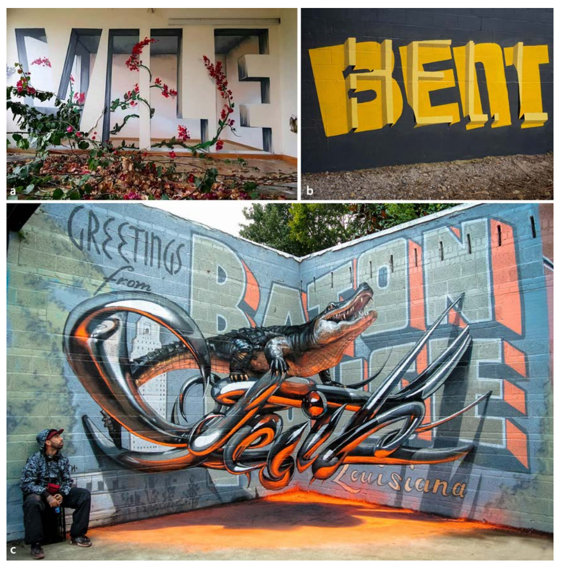
Fig.7- a) Vile's work; b) Camouflaging typography by Pref; Odeith's anamorphic composition