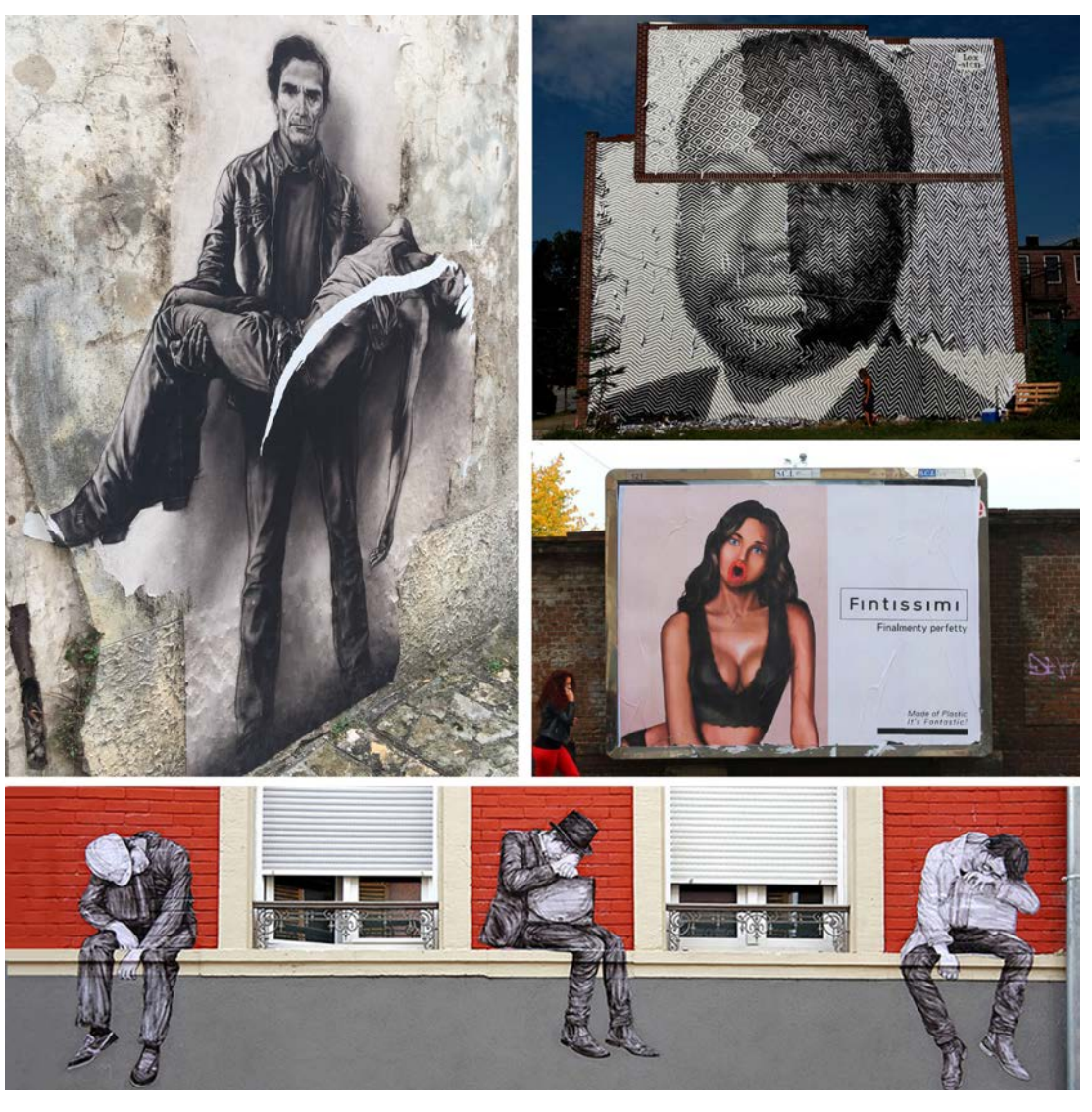
Fig.11- a) Ernest Pignon, Pasolini, Matera; b) Sten and Lex, Atlanta, USA; c) Hogre Doublewhy, Finalmenty Perfetty, Subvertising, Turin, 2017; d) Levalet, Paris