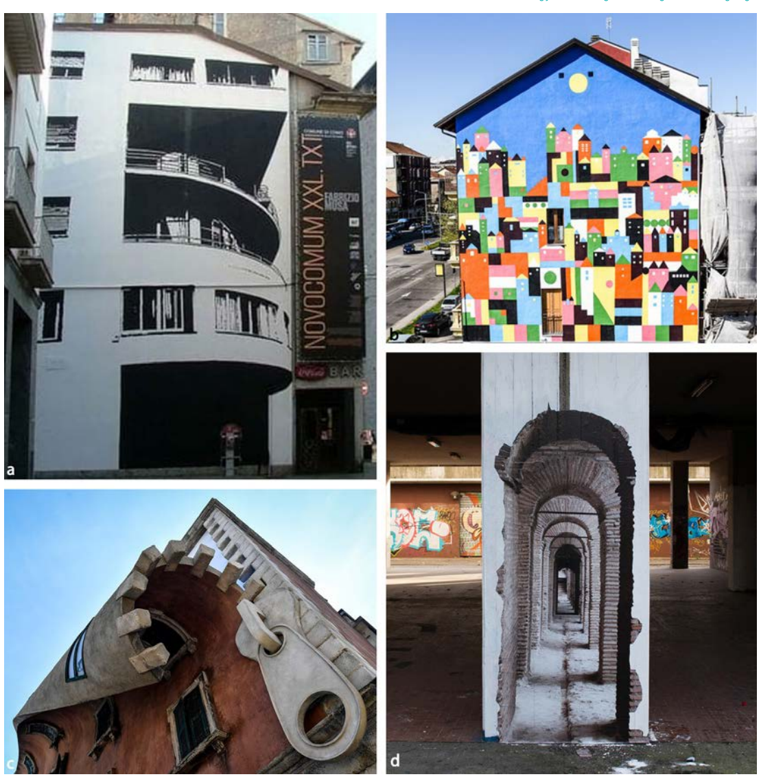
Fig.5- Some examples of architectural and landscape works. a) Fabrizio Musa, Novocomum, Como, 2004; b) Gometric Bang, murales per Collegno Si-cura, Collegno, 2019; c) Alex Chinneck, IQOS World Revealed, Fuorisalone, Opificio 31, Milano, 2019; d) Sbagliato, Intervento non commissionato, Bologna, 2014.

Vitalism, contrasting colours, reference to popular culture and political involvement, typical of Muralism, also influenced the American artistic environment of the post-war period, allowing the opening of new experimentations. Abstract Expressionism considered it an emotional painting from which to experiment. Pop Art was born from the desire for contamination with popular culture. cinema, comics, television, etc. The quotations of advertising posters, comic strips and everyday objects became a means of breaking with traditional figurative art. The visual substrate combined with the growth of the postmodern city enhance the development in the 70s of the writers' movement as a transgressive, controversial and illegal practice. Starting from the phenomenon of Tags, a youthful habit that consists in signing (tagging)