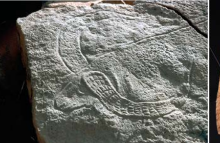
Fig.1- Original graffiti, sche-