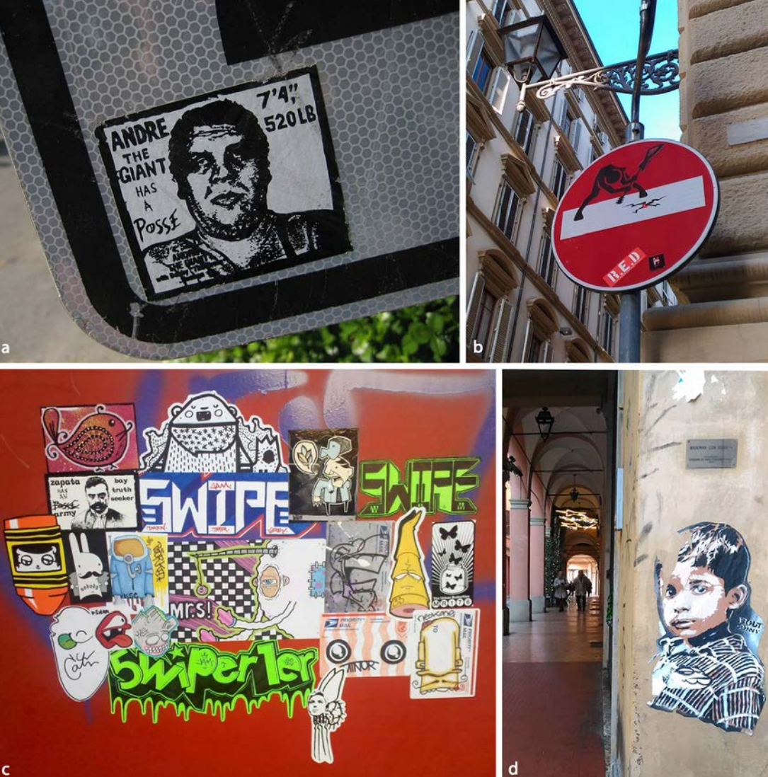
Fig.10- a) Shepard Fairey aka Obey, Andrè The Giant Has Posse; b) Clet, Firenze; c) composition of typographic stickers; d) AboutPonny, Via del Pratello, Bologna.

its various messages to much wider audience. Its origins roots into the world of American skater and punk rock culture before the appearance of adhesive labels as an alternative to graffiti with spray and markers in the mid-eighties. The artist Shepard Fairey aka Obey was decisive in the evolution of the practice as an artistic form independent of belonging to a band or political party; in 1989 he launched the first campaign Andre The Giant Has Posse, focused on the massive diffusion of an image that won the challenge of recognisability provoking the public opinion about the meaning of the operation (fig. 10). In the perspective of repetition and seriality is also inserted the poster art that finds in the affiche his ancestor. Once the poster has been drawn by hand or by printing, the street artist affixes it on the