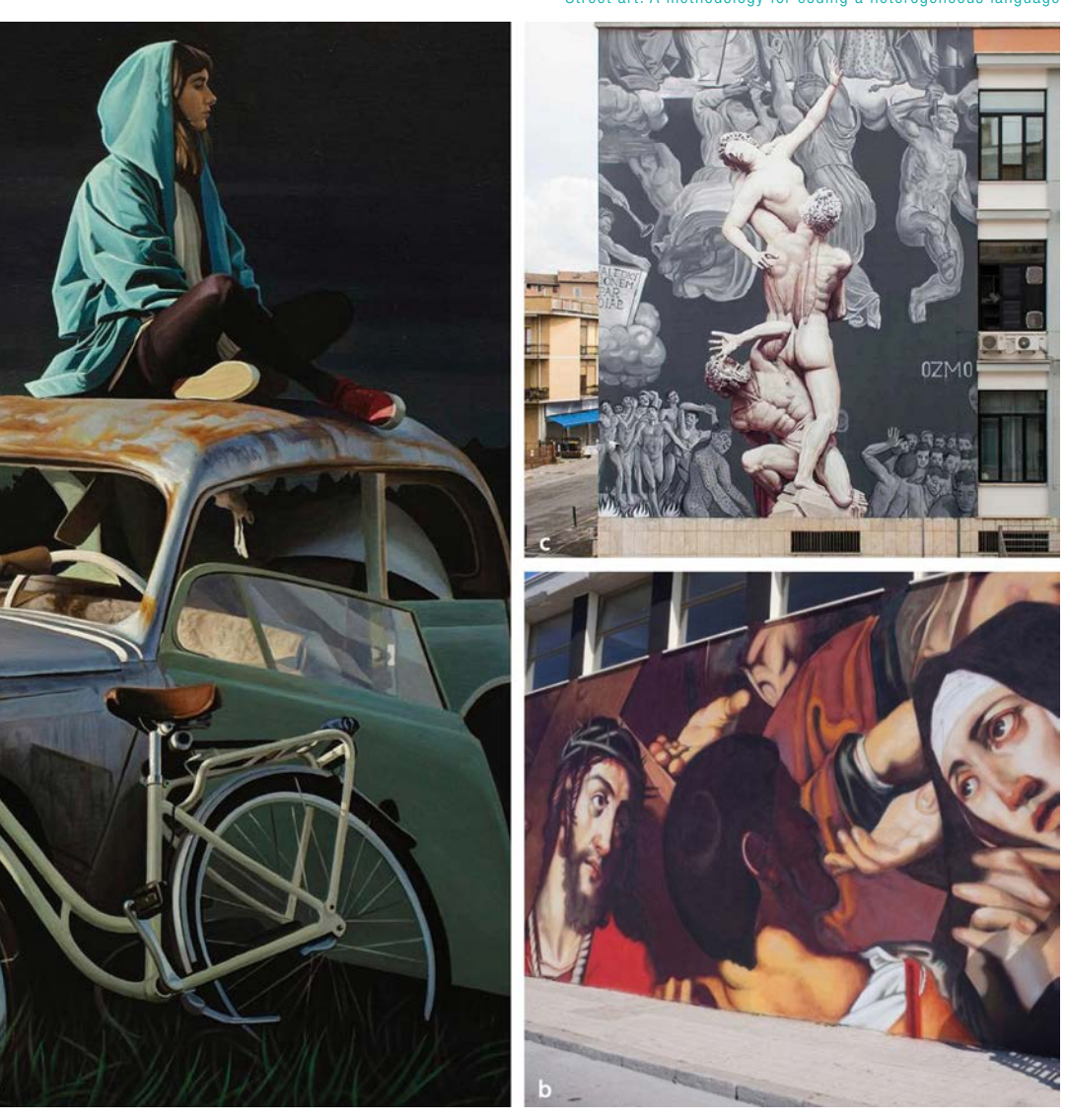
Fig. 3 - Examples of figurative artworks. a) realistic work by Lonac, b) a holy scenes by Andrea Ravo Mattoni c) 'll suono delle trombe' by OZMO.