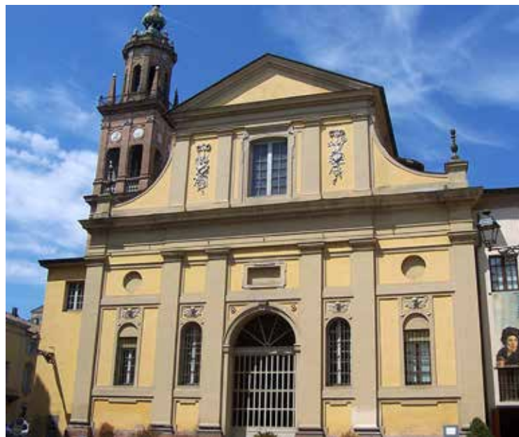
Fig. 1. The facade of the former church of St. Ludovico in its current configuration.

Necessarily, the methodological approach was interdisciplinary and it was divided into three main phases: a first phase of data collection (knowledge) was followed by a second step of interpolation of the various information collected (interpretation) and by a third