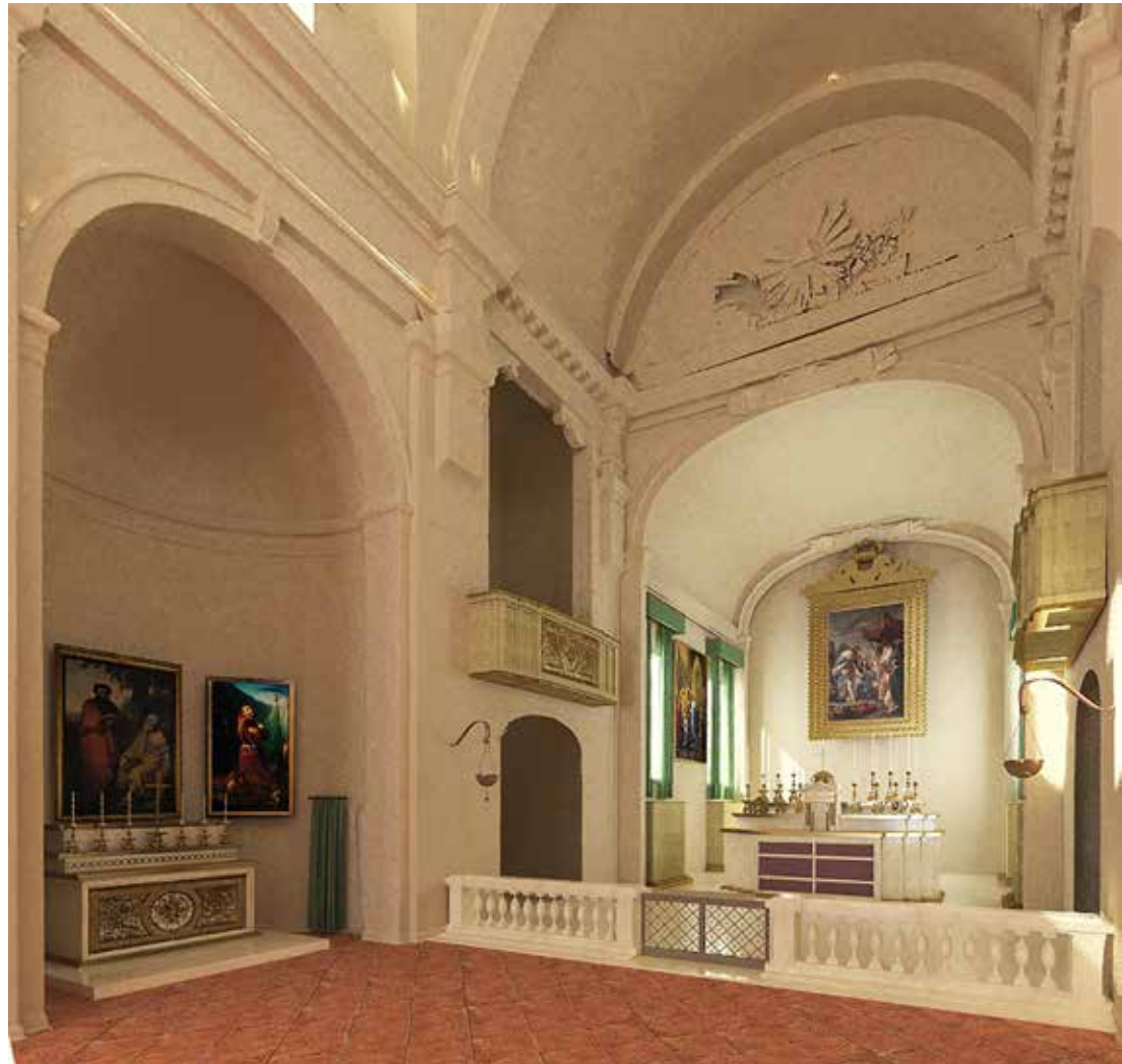
Fig. 8. Another view of the digital model in which visitors can see the choir which no longer exists and all the rich decoration and furnishing now dispersed.

On the other hand, if it is true that the main objective of these experiences must always be to raise public awareness of the historical, artistic and architectural heritage making it more accessible and attractive, the experimentation in act has also allowed to develop some considerations, which resulted in an integrated survey methodology, able to develop an eminently scientific approach to the theme. Since the communication of spatiality, holy grail of survey and representation of architecture, can no longer disregard the new opportunities offered by technology, it is of the utmost importance, especially in this transitional phase, to deal critically any case in relation to the different methods of communication.