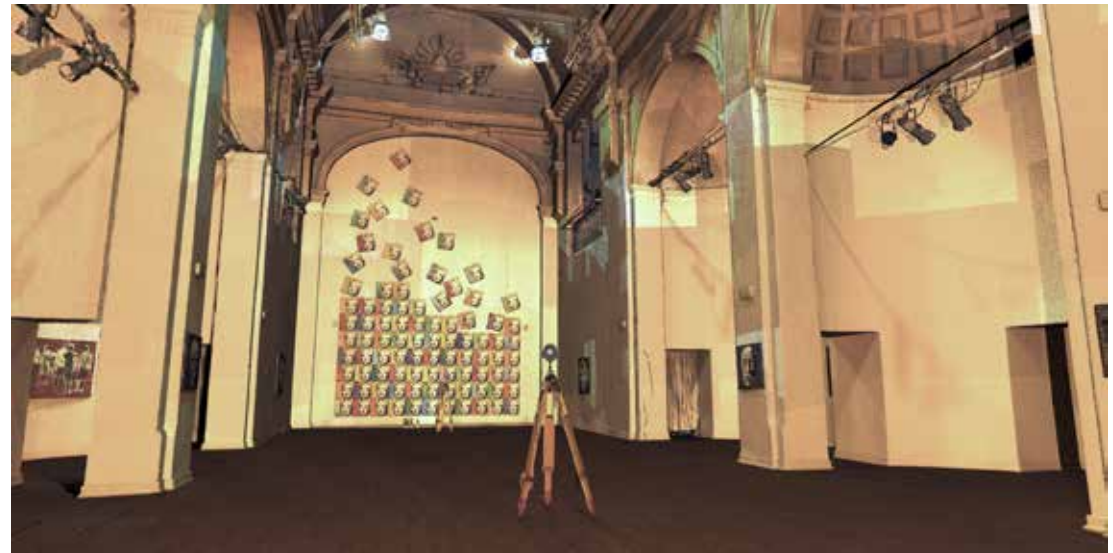
Fig. 3. Snapshot of the point clouds obtained by the laser scanner survey of the interior of the former church of Saint Ludovico, now used as an exhibition gallery for temporary exhibitions.

At the end of the data collection phase, before proceeding to the realization of the digital model, it was decided to interpret all the information retrieved through the historical and iconographic researches and through the survey. This step was based on a comparison between survey data and historiography data, on the direct observation of the building in its current configuration and on the analysis of coeval artworks and architectures. This phase of data interpretation, which is the added value of the whole project and - if properly conducted – ensures the scientific nature of the work, necessarily entailed a strong critical synthe-