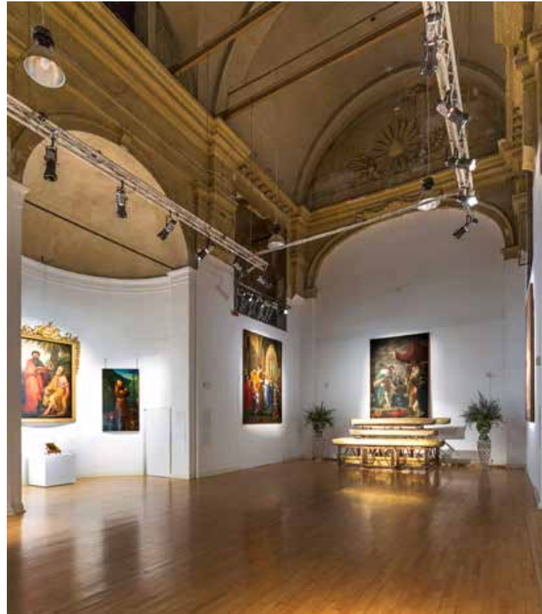
Fig. 6. Photographic image of the exhibition.

and shading information of the surface. As anticipated, the developed app currently includes two different operating modes: with the help of a stereoscopic viewer, the first section of the application allows an immersive visit in virtual reality within the reconstructed space of the church. By means of a controller connected to the smartphone, the user