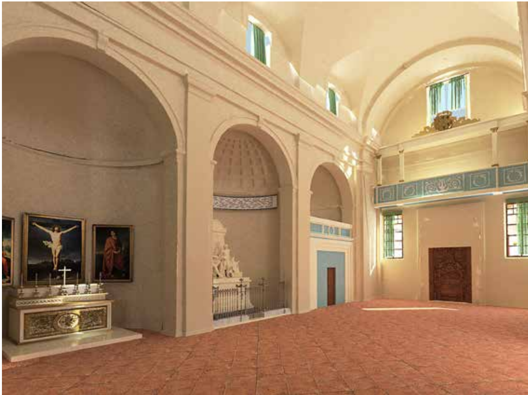
Fig. 7. View of the digital model that has been loaded in the app, and that visitors can see through special viewers.

the smartphone interact with the rendering engine of the two stereoscopic views correctly orienting the perspective. Taking advantage of the multi-user gaming libraries supplied by UNITY, the app also provides the ability to perform virtual tour with multiple users in the same virtual space at the same time and interacting with each other. All this allows the user of the App a more social approach through the contents. This is imperative to attract large audiences.