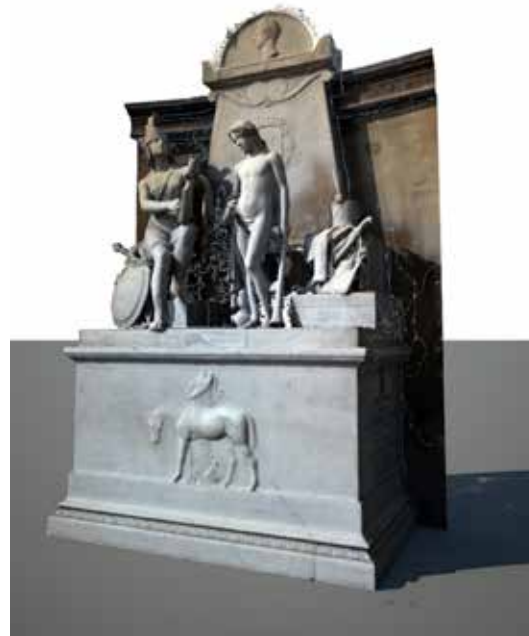
Fig. 4. The digital model of the tomb of Neipperg.

It is a commonplace to say that the church of St. Ludovico of Maria Luigia will exist anymore. Even if it was possible to restore the original appearance of the building and convert it back to the cult, the historical, social and cultural context is too changed because an operation of that kind can easily find sustainable justifications. Also, the exact restoration of the palatine chapel would be particularly onerous: in fact, the choir can be rebuilt only sacrificing two floors of municipal offices made in the middle of the last century in its original volume, the stands of the Chamberlains and