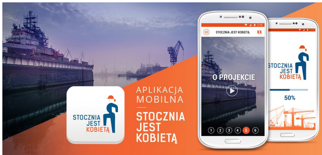
Fig.17 - Metropolitanka: Shipyard is a woman (2013) audio guide mobile application

in the 1980s; and 'A' route – about women artists and art-centred activities. Metropolitanka has developed the map Women Routes of Gdansk Shipyard , outlining those three thematic trails, which has been available online and as a printed leaflet. Additionally, there has been an audio guide, allowing individual visitors to wander around the shipyard year-round, to enable walks as an individually embodied connection with the shipyard's women, guided by the voices which are reinserted into the sites and spaces where they once were heard. Since the beginning of the project in 2012, over 3000 people have participated in the guided walks. In March 2016, a mobile application that describes a trail around the premises with a smartphone or tablet was launched, alongside four podcasts about the jobs performed by women in the shipyard, describing working conditions and including a commentary on social and cultural aspects of employment at the shipyard. In addition, a digital archive containing old photographs, the