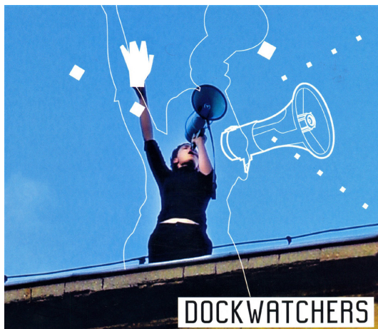
Fig. 14 - Dock Watchers (2005) Cover page of the post-conference publication

age protection were: "Wyspa" Foundation, NO for the Shipyard demolition and Metropolitanka (Metropolitan Woman).