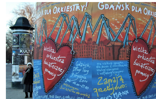
Fig. 18 - Poster promoting charitable funding in Gdansk (2008)

project's documentation, interviews and stories of women linked to the shipyard was launched (Miller, 2016).