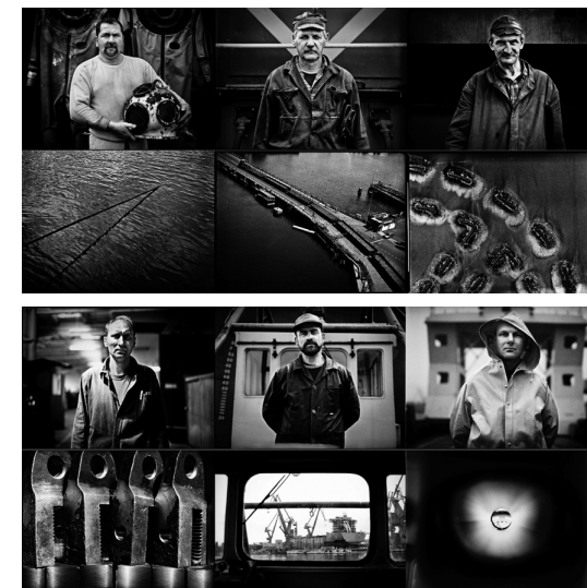
Fig. 6, 7, 8, 9 - Michal Szlaga: Shipbuilders – Vanishing professions (2003)