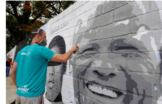
Fig. 3 - Gentileza Saudade, Belo Horizonte. Art by Sérgio Ilídio, image by Adão de Souza, Prefeitura de Belo Horizonte, 2018.

For the artists and professionals selection, the movement's management team initially engages in dialogue with the neighboring communities. The artists who create the interventions are pref-