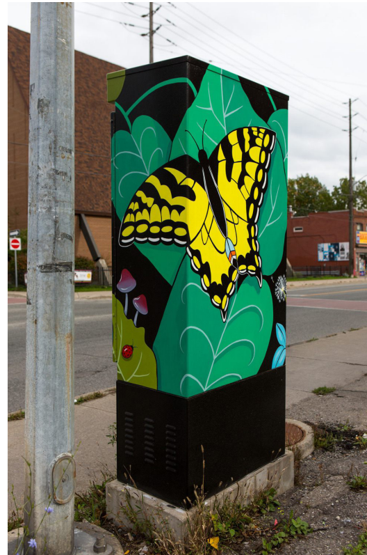
Fig. 6 -Outside the Box, Etobicoke, Toronto. Art by Sarah Cannon, image by StreetARToronto.ca, 2019.

(which can help provide accessible washroom facilities and water supply), and are accessible by public transit.