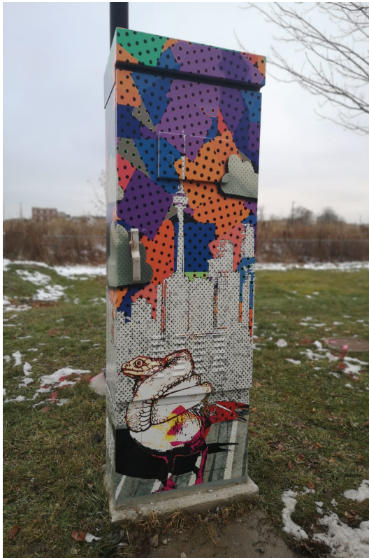
Fig. 5 - Outside the Box, North York, Toronto Art by João Freire, image by Bill Suddick, 2019.