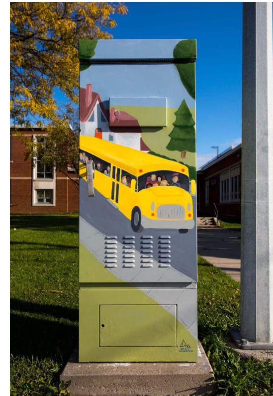
Fig. 4 - Outside the Box, Scarborough, Toronto. Art by WAP Collective, image by StreetARToronto.ca, 2018.

The boxes that are identified as potential mural locations are those that provide a safe distance from the road (to ensure the safety of the artist painting), are close to local business and restaurants