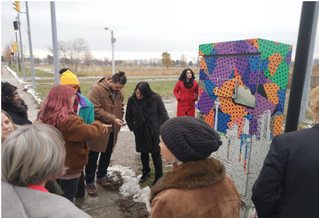
Fig. 8 - Outside the Box – Winner's works inauguration at Seneca@York, North York, Toronto.

Through the integration of the administrative bodies to identify needs and establish priorities, the movement can identify other urban pieces of equipment and street furniture susceptible to interventions and those responsible for their