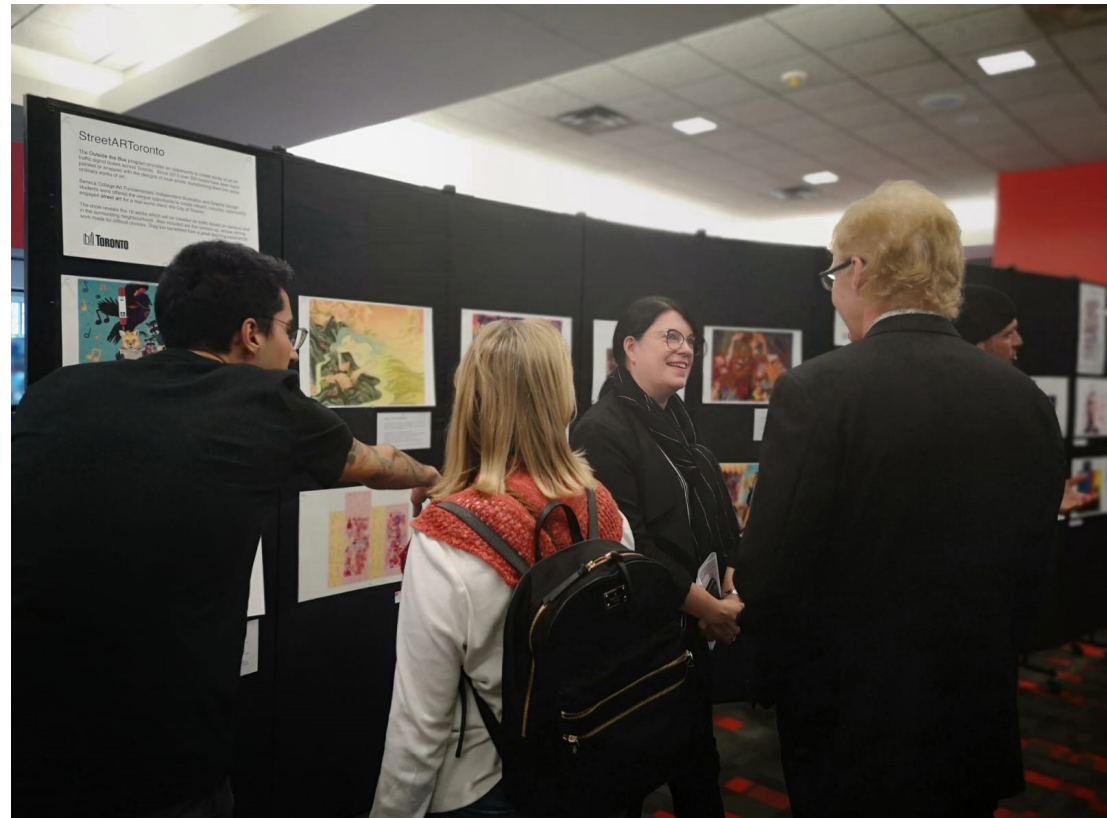
Fig. 7 - Outside the Box – Winner's works exposition at Seneca@York, North York, Toronto.