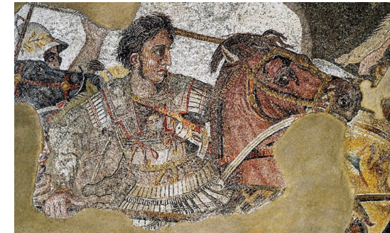
Fig. 2 - Mosaic. Issos battle. Pompeii S I bC.