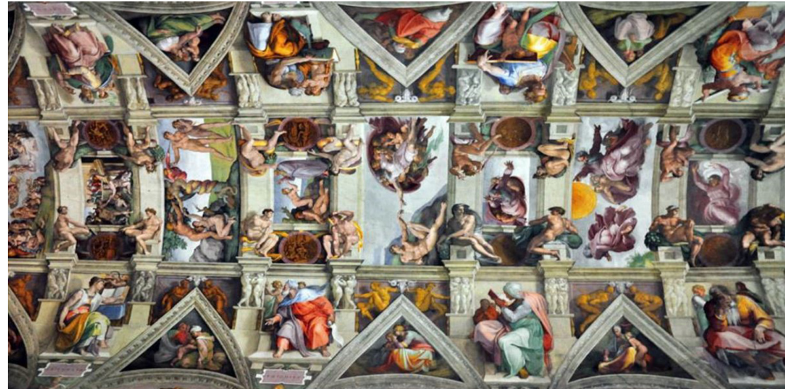
Fig. 3 - Sistine Chapel, The Vatican. S XVI.

Mural art, as an intrinsic component of architecture itself, is a welcome part of architecture. It brings meaning to the building and the architectural space in which it is carried out and which it configures. Historical works of mural art cannot be isolated; they must be considered in accordance with the architecture and the space in which they will be integrated. Contemporary mural art, generally alien to previous architectural design, either brings its own message outside of the architecture itself, which it parasitizes, or intrudes