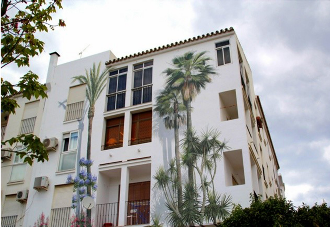
Fig. 7 - Reflejos del jardín

From the perspective of conception, one of the aspects he considers most important is to ignore the division of matter, architectural support, and creative space through the use of trompe l'oeil. Prolonging the sky within the painting, creating virtual spaces, or incorporating the surrounding vegetation are some of the graphic resources he uses. He plays with the architectural environment, shading and perspective, and he invokes the complicity, even emotional, of the observer who ends up being the protagonist of his work.