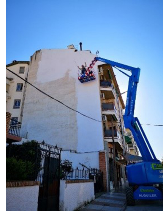
Fig. 8 - Wall's preparation.

viability. For this, it is necessary, from a certain introspection, to capture the motive and to choose and know well the physical space and the social context where it is to be done. This reflexive process requires great effort since the artistic part is usually contaminated by conditioning factors that are alien to the creation itself but are ultimately fundamental for the work to become a reality. For that reason, the mural artist needs certain qualities of a manager that are essential to obtain the objective, which is none other than to materialize the artist's idea. At the same time that multiple managements of all types are made, a multitude of schemes and drawings on paper or photographs are produced until a composition that is