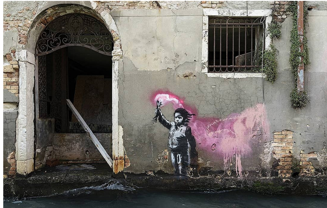
Fig. 5 - Banksy, Migrant child - Venice 2019.

It is necessary to clearly differentiate mural painting in historical architecture from current painting, which is not always attentive or integrated into the aesthetics of the building, although it sometimes attempts to improve its image. In addition to the message itself, in the new representations, there are many other aspects to be taken into account, such as the magnitude, the means, the technique, the orientation, the visibility and the distance of observation (Randrup, 2009). These are new murals that, in the common public space, are exposed to the critical opinion of a plural society that receives them in an ambivalent way as democratic art (Manzoni, 2019). This social recognition is one of the fundamental elements of their valorization and conservation (Rivera et al, 2000).