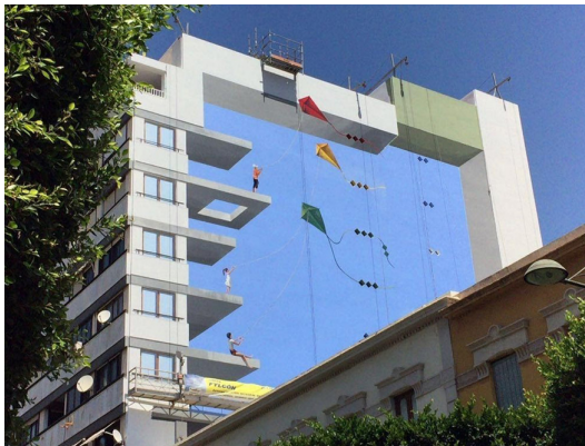
Fig. 16 - Flying kites (Volando cometas). After.

However, it is not just that. The buildings on which he intervenes are very concrete, and their qualities offer him the excuse to develop his art on them but also thanks to them. The divorce between architecture and mural painting does not disappear; there is no recovery of the lost relationship, but it is more bearable after the interventions of this artist, who is engaged in a dialogue from another era.