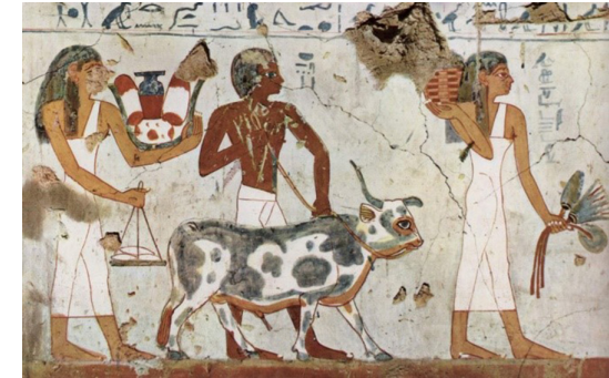
Fig. 1 - Funeral mural painting. Luxor, S XV bC.

This article is divided into four sections. After the introduction, which justifies and helps to contextualize the object, scope, interest, purpose and content of this work, we proceed in a second chapter to review the relationship between mural painting and architecture, including its main milestones