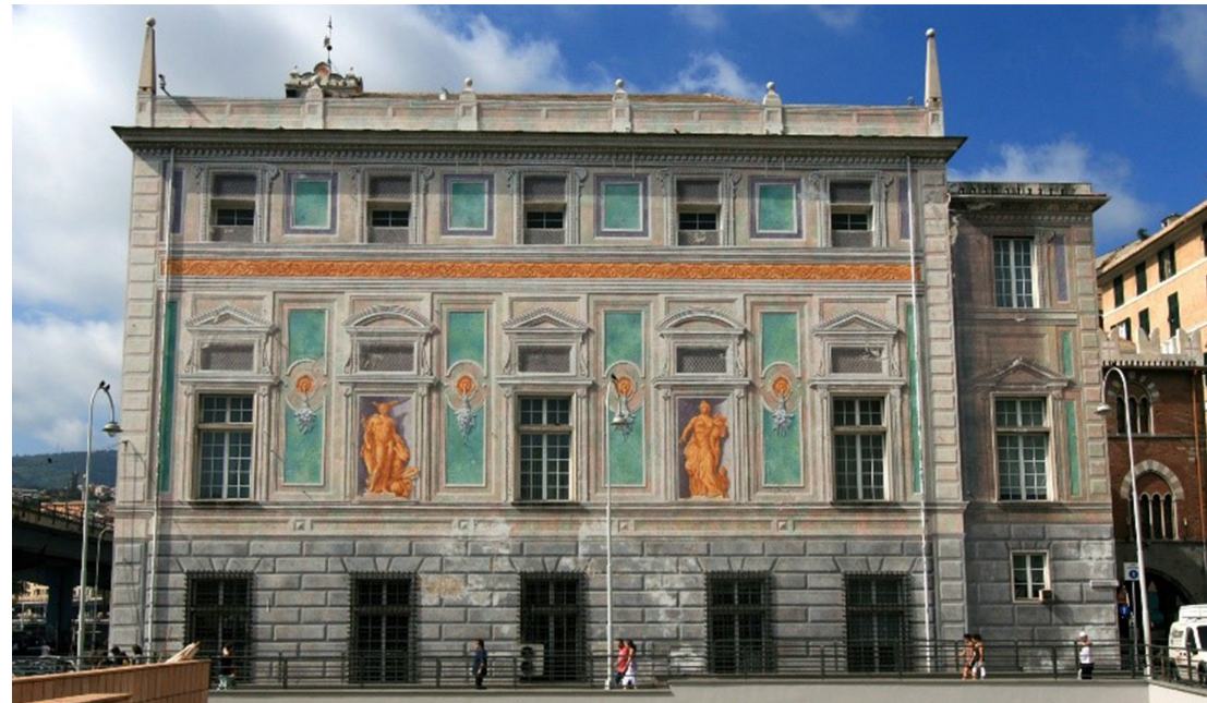
Fig. 4 - Palazzo San Giorgio, Genoa. S XIII – XVI.

The Modern Movement in architecture replaced the Modernism that emerged in the first decades of the 20th century, giving rise to the so-called "International Style", which developed in Europe in the period between the two world wars. However, it was after the second war that it expanded to the rest of the world. It is distinguished by the incorporation of new materials such as steel,