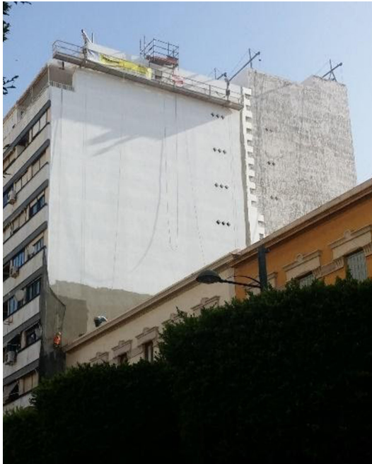
Fig. 15 - Flying kites (Volando cometas). Before.