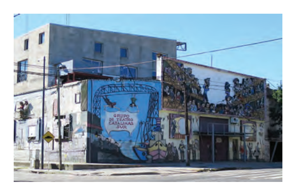
Fig. 12 - View of Catalinas Sur Theatre, with three-dimensional elements and dummies.

expressive techniques was further accentuated, experimenting with the use of light projections instead of painting (fig. 11) or by inserting, in the two-dimensions of the façade, of some three-dimensional elements or dummies, often leading to mocking theatrical effects (fig. 12).