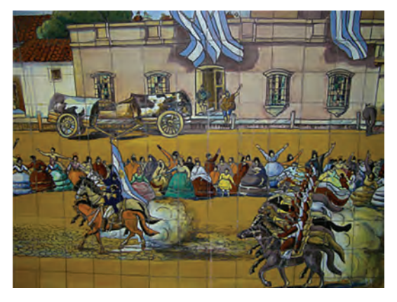
Fig. 9 - L. Matthis de Villar, Entrada triunfal del General Urquiza en Buenos Aires , (1939). In the wall decorations of the E line of Buenos Aires Subway the reference is that of the commemorative engraving of historical-patriotic events.

The movement of the episcope, used as a projection center, during the different stages of the tracing, produced an enveloping and almost dreamlike effect, similar to that of an anamorphosis. Probably, precisely these aspects of technical