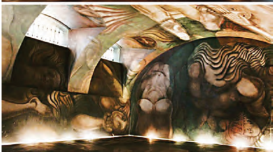
Fig. 6 - David Alfaro Siqueiros (together with J.C. Castagnino, A. Berni, L.E. Spilimbergo, E. Lázaro), Ejercicio plástico (1933).

guayan sculptor Enrique Lázaro), he painted in the cellar of the house of his patron, Natalio Botana, the mural entitled Ejercicio plástico , a singular and highly innovative work compared to the muralist tradition in general, but also to the artistic production, earlier and following, by Siqueiros. It is a representation – extended for 123 square meters on the vaults, curved walls and floor of the basement where it was originally placed [4]-in which sensual figures of female nudes seem to float in an amniotic aquatic space. (fig.6)