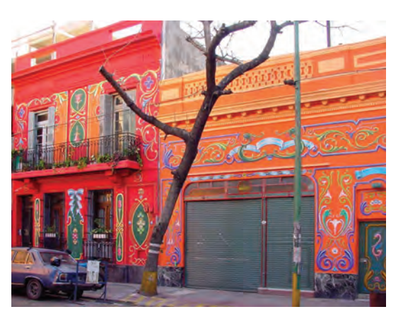
Fig. 17 - In 2004, following the El Abasto y el fileteado porteño competition, six facades in calle Jean Jaurès were decorated in fileteado .

Fig. 19 - Calle Lanín has been restored through the figurative redesign of the facades by the inhabitants, coordinated by the artist M. Santa María.