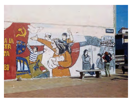
Fig. 7 - Brigada Castagnino, Sin título , (1983). Street art spreads in Buenos Aires through the foundation of muralist brigades by the artists who had collaborated with D. Alfaro Sigueiros.

The female figures represented were in fact traced on the wall, to then be sprayed in a second time, projecting through the use of an episcope the glass negatives, obtained from photos of Blanca Luz, Siqueiros's lover-model [5].