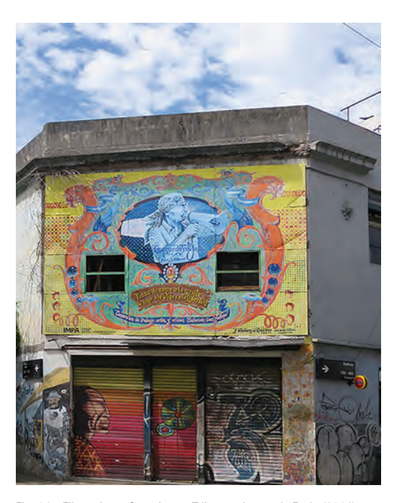
Fig. 14 - Fileteadores Conurbano, Tribute to Leonardo Favio . (2014), since 2019 recognized as Heritage of the historic center of the city.

Nevertheless, his figure, enclosed in a monochrome medallion in shades of blue, appears, however, as part of a wider figurative context, characterized by the style and typical elements of the fileteado porteño , which together with the muralism, and perhaps even more markedly than it, constitutes the typical iconographic language of Street art in Buenos Aires.