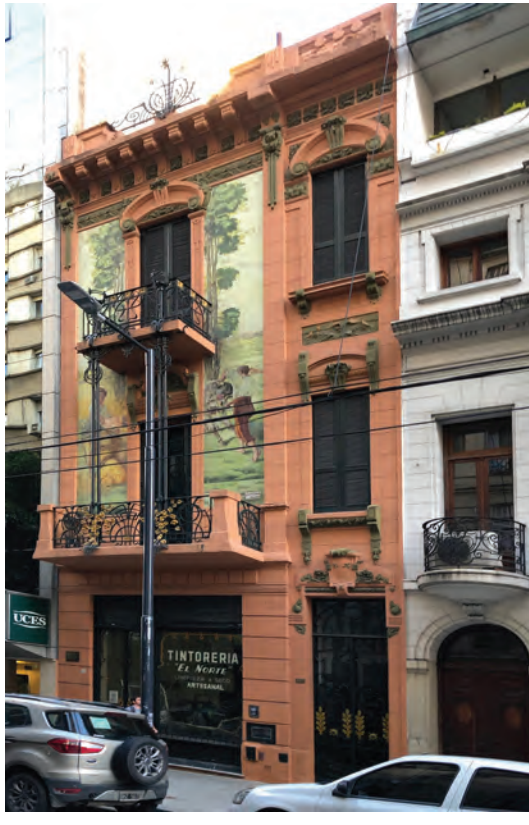
Fig. 3 - P. Pinzauti, Decoration of the Casa de los Azulejos façade (1911).

In particular, in the Art Nouveau façades, even if designed together with the building, their decoration always establishes a dialectical relationship with the articulation of doors and windows, intertwining with them in a counterpoint of imaginative plant compositions. The realization generally makes use of different artistic techniques, often hybridized together, in an osmotic relationship between wall painting, plastic modeling and mosaic decoration with great communicative intensity.