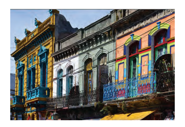
Fig. 1 - The linguistic and chromatic exuberance characterizing the urban landscape of Buenos Aires.

The building environment is essentially composed of houses, whose construction has gradually saturated the internal surface of the blocks, within which even the most important and representative monuments and public buildings have adapted. In addition, a process of continuous building replacement on individual lots has produced an incredible typological and social mix, in which recent tall buildings coexist alongside the low houses of the early twentieth century, where the rooms, once overcrowded by migrant families or elegantly furnished to celebrate the rites of a recent conquered bourgeois life, they gather aroun the internal patios (fig. 2).