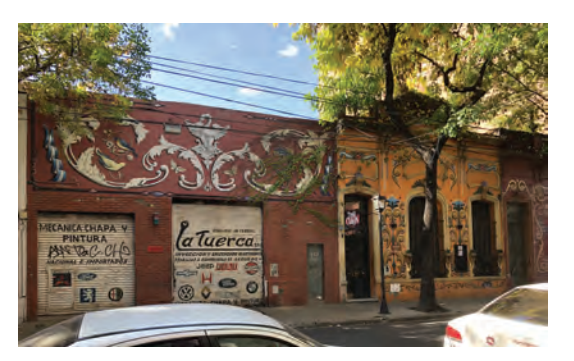
Fig. 18 - Calle Jean Jaurès is now known as Paseo del fileteado and the decoration of the fronts has represented the instrument for its refurbishment.