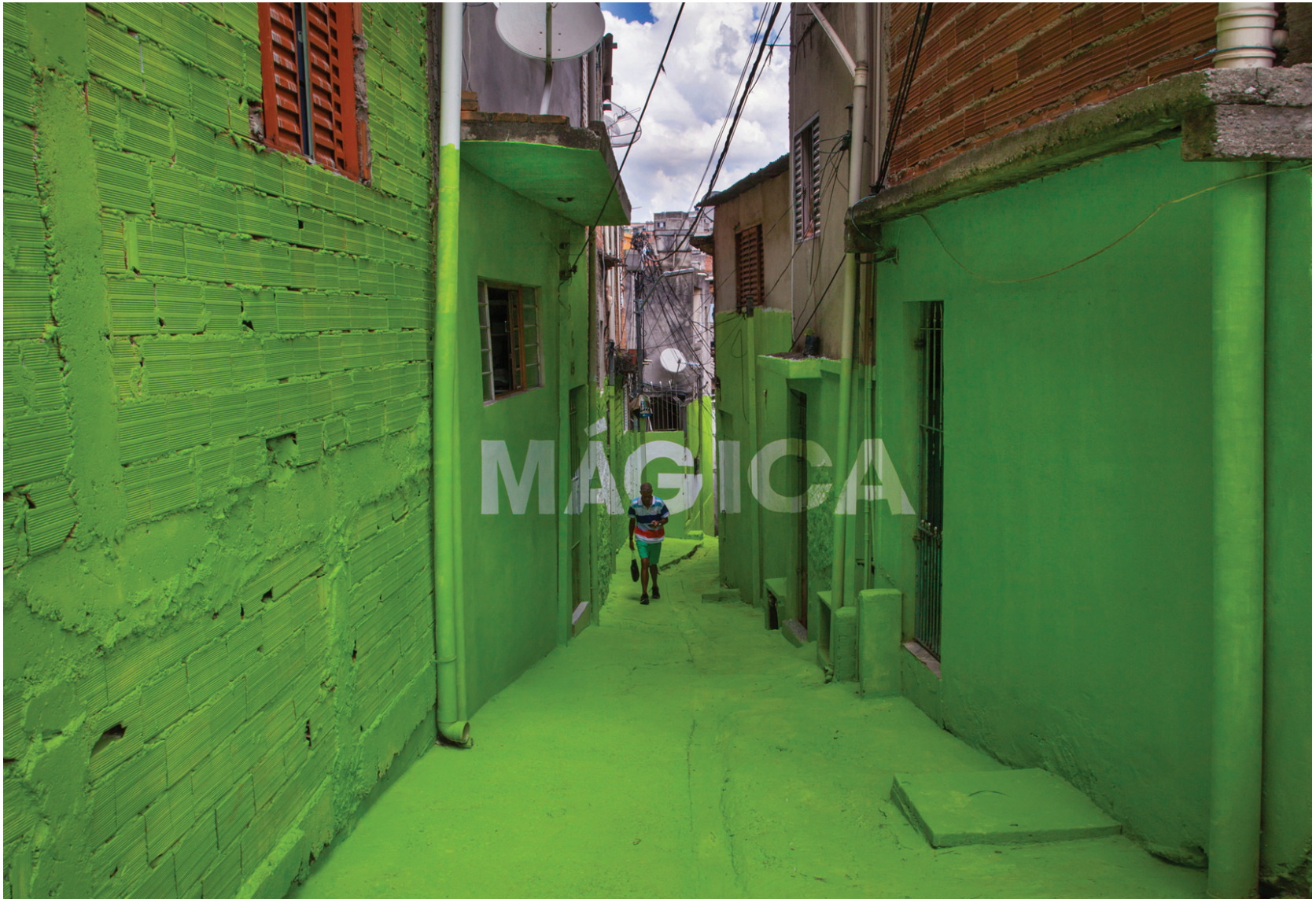
Fig. 12 - Luz nas vielas , São Paulo, Brazil, 2017. Mágica (by Boa Mistura).