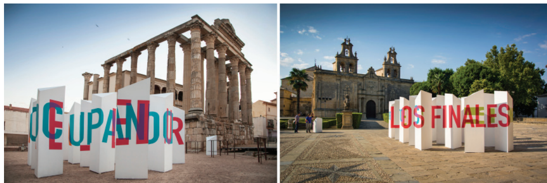
Fig. 18 - Laberintos Líricos , World Heritage Cities, Spain, 2016-2017. Left, Ocupando , Mérida; right, Los finales , Úbeda (by Boa Mistura).

Author is truly grateful to Boa Mistura for granting the interview and for what the collective does through its art with deep sensitivity. All images courtesy of Boa Mistura.