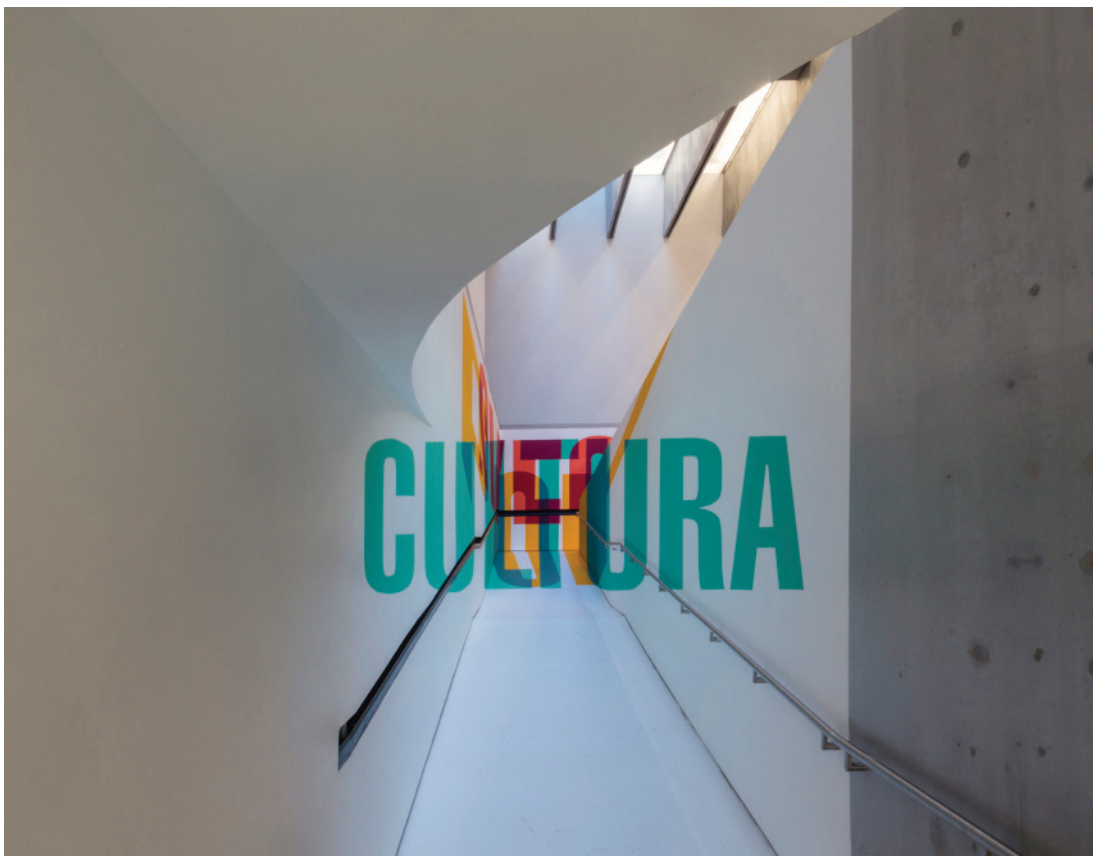
Fig. 15 - Cultura / Sveglia / Popolo , Roma, Italy, 2018. Cultura (by Boa Mistura).