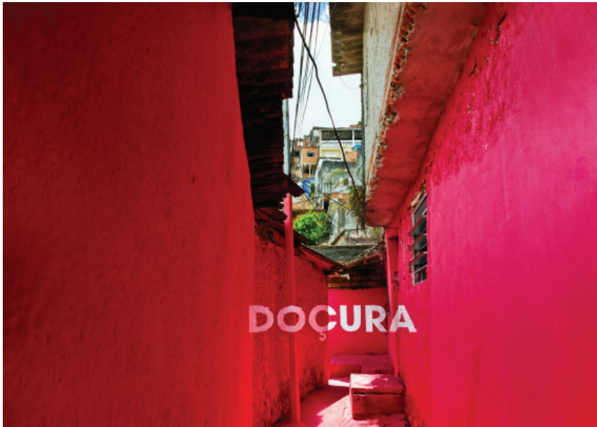
Fig. 10 - Luz nas vielas , São Paulo, Brazil, 2012. Doçura (by Boa Mistura).

baggage, would be impossible to intervene. It is beautiful that such a technical and mathematical process produces such a magical result.