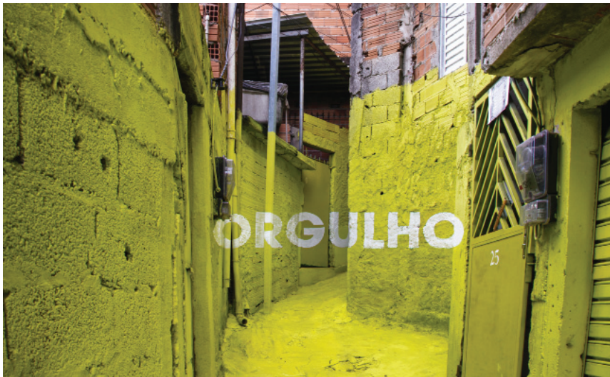
Fig. 11 - Luz nas vielas , São Paulo, Brazil, 2012. Orgulho (by Boa Mistura).

In the second place, the point of view is chosen in a natural way. To make anamorphism work, the different planes must be arranged without cracks. If any gaps appear, anamorphosis does not work. That is why there is a millimetric task looking for that specific point where everything is arranged, where anamorphism works and the succession of planes generates an interesting deformation in the original work.