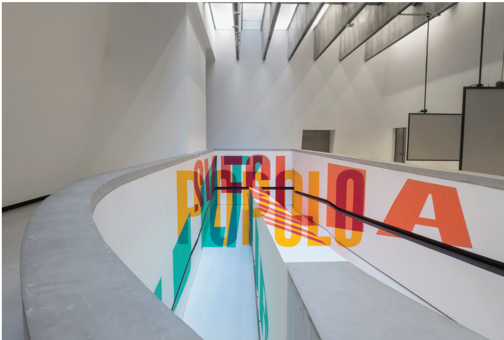
Fig. 16 - Cultura / Sveglia / Popolo , Roma, Italy, 2018. Popolo (by Boa Mistura).