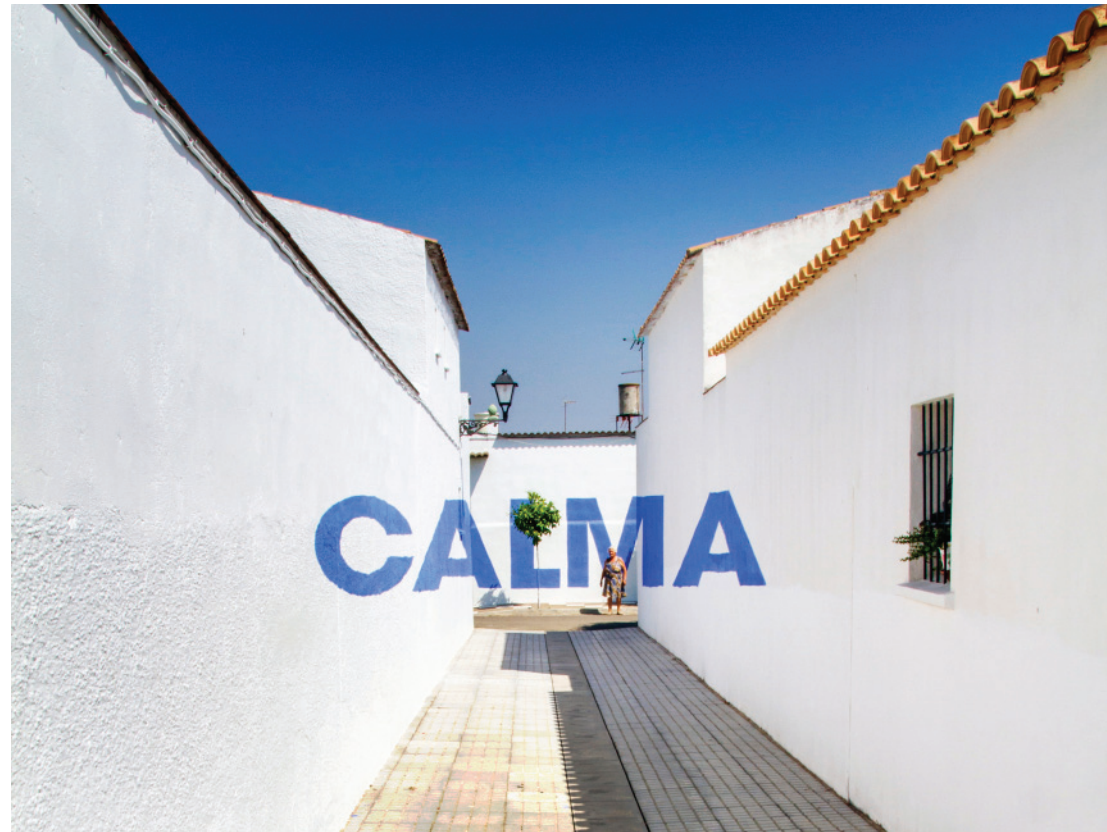
Fig. 1 - Azul sobre blanco , Cordoba, Spain, 2013 (by Boa Mistura).

anamorphosis interventions Azul sobre blanco (Blue over white) [2]. On the surfaces of small white houses, which are arranged between narrow alleys, six words materialise, blue like the colour of the sky that stands out on the white walls. Sosiego (quietude), Serenidad (serenity), Calma (calm), Remanso (haven), Claridad (clarity) and Luz (light) are the six words that summarise the life of two communities of Cordoba affected by the artistic intervention (fig. 1).