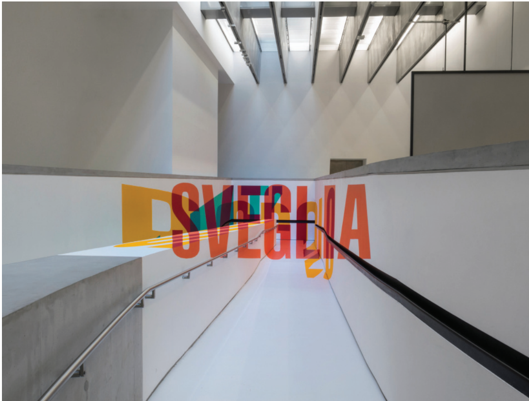
Fig. 17 - Cultura / Sveglia / Popolo , Roma, Italy, 2018. Sveglia (by Boa Mistura).