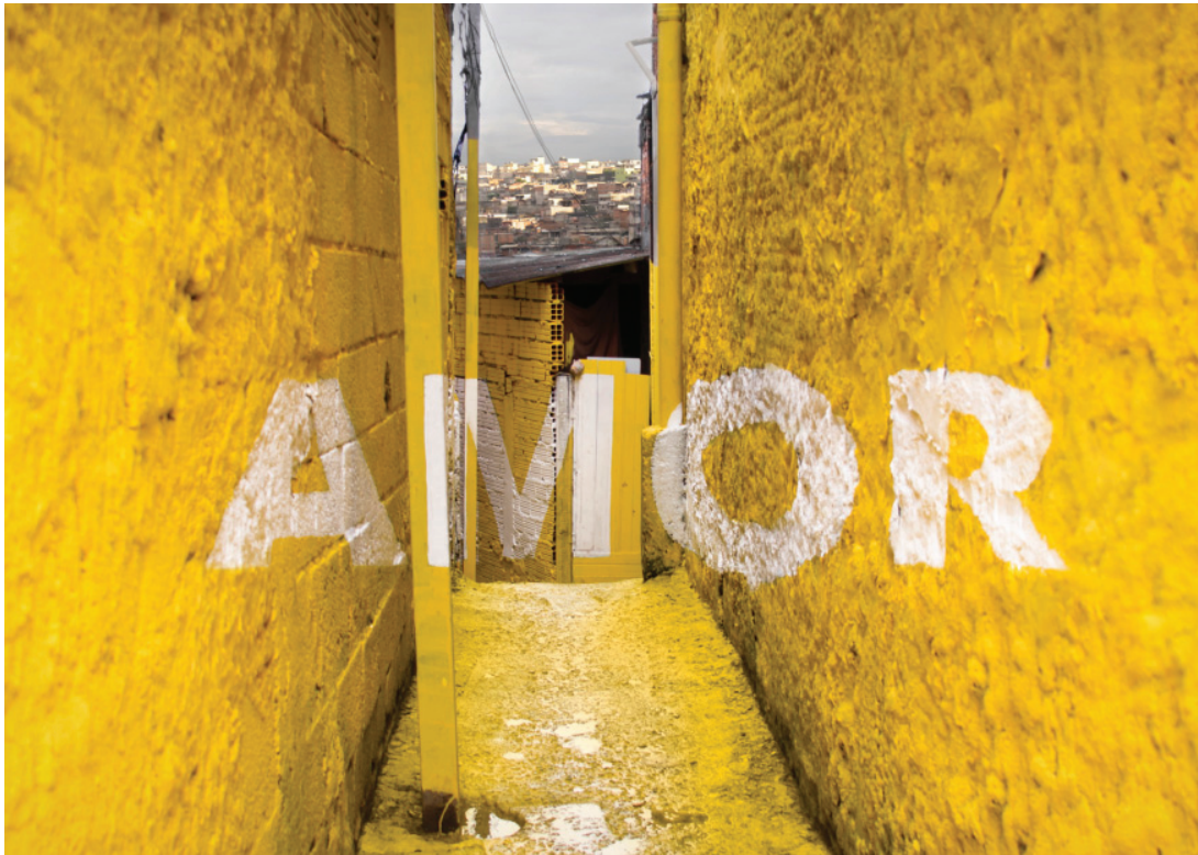
Fig. 6 - Luz nas vielas , São Paulo, Brazil, 2012. Amor (by Boa Mistura).

Anamorphosis is also used in the case of museum installations, as in the project carried out in 2018 at the MAXXI National Museum of Rome, in the context of collective exhibition "La Strada: dove si crea il mondo" [7]. Walking through a museum ramp it is possible to read three words from three different viewing spots, made with overlapping colors, through crossed anamorphosis (figs. 15-17). During a workshop given from Boa Mistura, the choice of the words Cultura (culture), Sveglia (wake up), Popolò (people) came from the answers that the participants gave the question "If the entire city of Rome