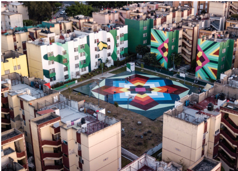
Fig. 14 - Nierika , Guadalajara, México, 2017 (by Boa Mistura).

Art is nothing more than an expression of culture, a tool to communicate what we are and our roots, that is why it is so important to keep our identities alive. We like to think that with our work we are bringing something positive to the cities. There's a friend from our neighbourhood who once told us "Doctors heal, mechanics fix cars, and artists move, touch people's hearts". For us, that is the