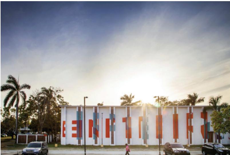
Fig. 2, 3, 4 - Pensar/Sentir , Panama City, Panama, 2014. (by Boa Mistura).

Pensar/Sentir is an intervention carried out in 2014 at the Ciudad del Saber (City of knowledge) in Panama City [3]. The artists worked with the students of the School of Architecture Isthmus using their signature anamorphic style. The chosen building is the Ecumenical Temple, turned today into an exhibition centre. In this case Boa Mistura intervenes on the building in two opposite directions, mixing on one facade the two words Pensar (think) and Sentir (feel) which can be correctly read, one at a time, from the two opposite ends. The words are two key elements in obtaining knowledge and wisdom (figs. 2-4).