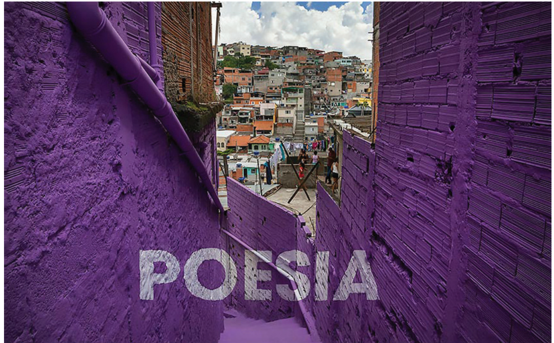
Fig. 13 - Luz nas vielas , São Paulo, Brazil, 2017. Poesia (by Boa Mistura).

After that one, others came to keep the flame lighting. The Brasilândia favela where Luz Nas Velas was born, will always be our second home for the wonderful people who welcomed us as one of the family. In the Nierika project, in Guadalajara, Mexico, together with the neighbours, we managed to transform the use of a square so that it would stop being a drug selling point and begin to be used by the children and elders of the community; in Buenaventura, Colombia, in the houses of this humble coastal community we could see the marvellous style of