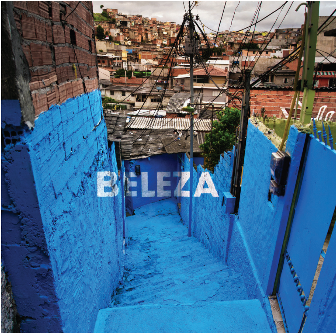
Fig. 7 - Luz nas vielas , São Paulo, Brazil, 2012. Beleza (by Boa Mistura).