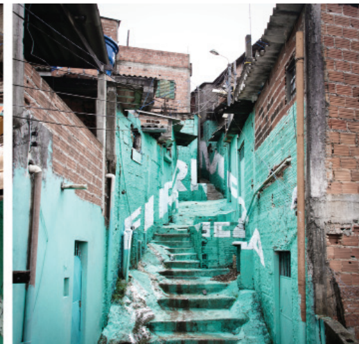
Fig. 8 - Luz nas vielas , São Paulo, Brazil, 2012. Firmeza (Boa Mistura).