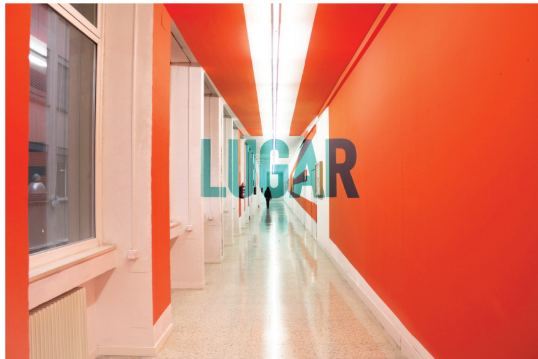
Fig. 5 - Lugar/Tiempo , Madrid, Spain, 2018. Lugar (by Boa Mistura).

words are revealed by traveling through space in the two opposite directions (fig. 5).