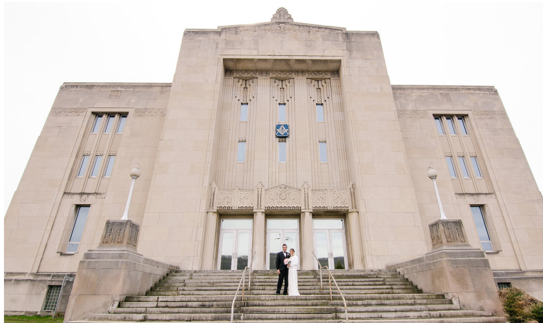
Fig. 11 - Johnstown Lodge façade, USA.

https://www.facebook.com/johnstownmasonictemple/photos/p.3600210230003059/3600210230003059/?type=1&theater