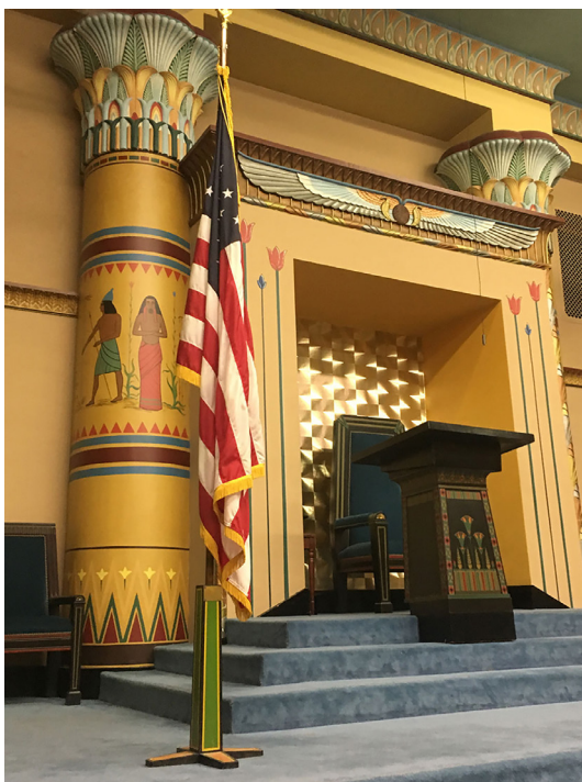
Fig. 13 - Part of a room shows the revival of Egyptian style. https://www.tribdem.com/johnstown_magazine/masonic-temple-there-s-nothing-secret-about-it/article_bd97c4b4-ff19-11e9-8124-073b7c38325c.html

Therefore, I encourage the revival of the pharaonic style, but only by choosing carefully the pharaonic elements. If it will be revived on the houses of worship of another religion or belief, it must be done with great awareness because of the close link between the symbolism of those elements and the religious faith and gods of the ancient Egyptians. Researchers, such as art historians and authors, must ensure accuracy when they are analyzing pharaonic or neo-pharaonic architectural style and its philosophy, so that future researchers, when using them as references, don't base their opinions on erroneous opinions. This causes scientific confusion in the understanding of ancient Egyptian civilization.