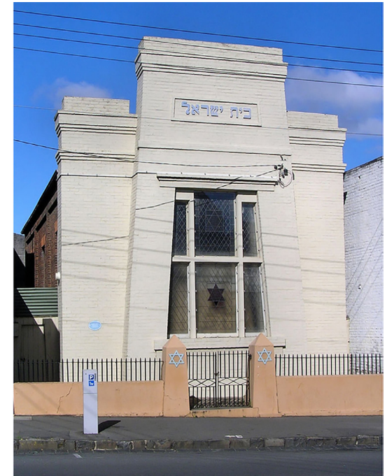
Fig. 8 - Launceston Synagogue façade, Australia. http://ttnotes.com/launceston-synagogue.html#gal_post_21172_launceston-synagogue-launceston.jpg

DOI: https://doi.org/10.20365/disegnarecon.25.2020.16