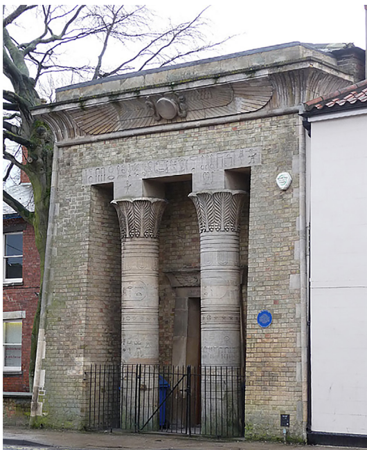
Fig. 10 - Freemasons' Hall, England.