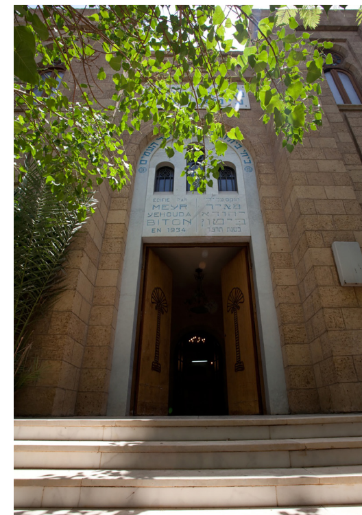
Fig. 5 - Meir Enayim synagogue façade, Cairo, Egypt. http://archive.diarna.org/site/detail/public/221/

DOI: https://doi.org/10.20365/disegnarecon.25.2020.16