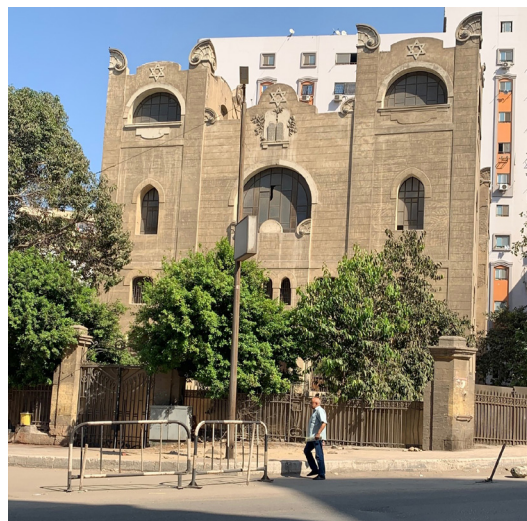
Fig. 3 - Moussa Dar'l Synagogue, Cairo, Egypt. https://egypttours36.com/2020/09/22/lost-1000-year-old-hebrew-bible-found-on-dusty-cairo-synagogue-shelf/

Usually, when architects revive ancient Egyptian architecture, they use these architectural elements in their designs in a complete simulation, without any alterations or with a modern formulation. In this regards, I have some doubts that some of those architects are aware of the symbolism of the pharaonic architectural elements.