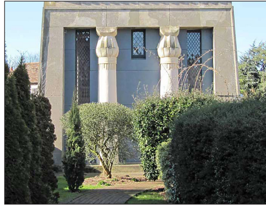
Fig. 9 - Old Synagogue façade, England.

http://www.canterbury-archaeology.org.uk/synagogue/4590809562