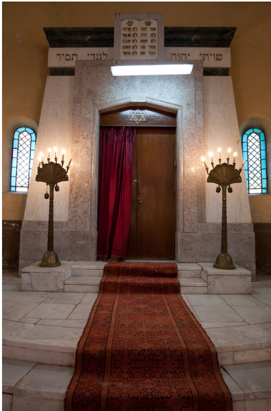
Fig. 6 - Meir Enayim torah ark. http://archive.diarna.org/site/detail/public/221/

Sabil Al-Khizindar, Abbasiyya, Cairo, and it was named Moses Dari in 1934 (Yeshaya, 2010, p.142). The façade of the temple represents the word "Akhet," as does The Gate of Heaven Synagogue, but it is topped by a Star of David instead of the solar disk (Fig. 3). In the entrance there is a pair of small obelisks, and the capitals of the columns are formed in the lotus flower shape (Fig. 4), influenced by the architectural elements in ancient Egyptian temples.