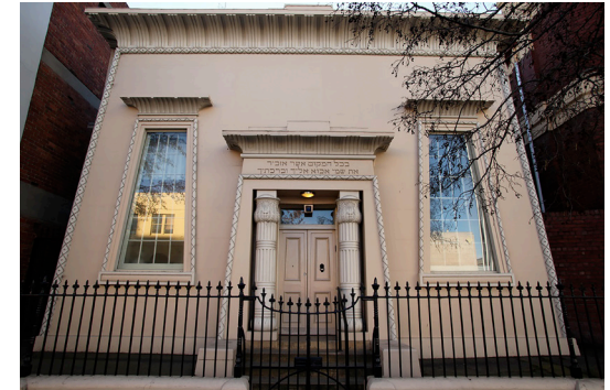
Fig. 7 - Hobart Synagogue façade, Australia. https://www.hobartsynagogue.org/photos/synagoguephotos/

This synagogue is located in Argyle Street, Hobart, Tasmania, Australia, and is the oldest synagogue in southern Tasmania. It was designed by the architect James Thomson and built in 1845. The building was created in the style of ancient Egyptian architecture to convey Judaism's ancient roots in Egypt (hobartsynagogue.org). The facade, the windows, and the outer frame of the door are trapezoidal in shape, surrounded by a frame topped by a cornice (Fig. 7), such as ancient Egyptian chambers in the temples. The levels of two windows on the sides are higher than the level of the door, to indicate the word "Akhet," which means horizon. There are two columns on either side of the entrance whose capitals are inspired by the lotus flower, which is sacred to the ancient Egyptians, but has here been reformulated in a modern manner. The winged solar disk is missing from all of the cornices; it seems that the architect realized that including it would express the ancient belief that the sun god was on the horizon and consequently omitted it.