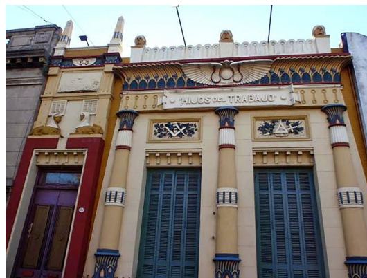
Fig. 14 - Hijos del Trabajo masonic lodge, Argentina. http://www.hijosdeltrabajo.com.ar/2015/04/origenes-de-la-masoneria-en-nuestro-pais.html