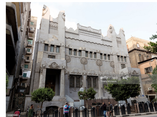
Fig. 1 - The Gate of Heaven Synagogue, Cairo. https://www.gettyimages.dk/detail/news-photo/cairo-egypt-november-29-2014-the-shaar-hashamayim-synagogue-news-photo/543877058

The main philosophy of the ancient Egyptian temple's design was to be in the form of a micro cos-