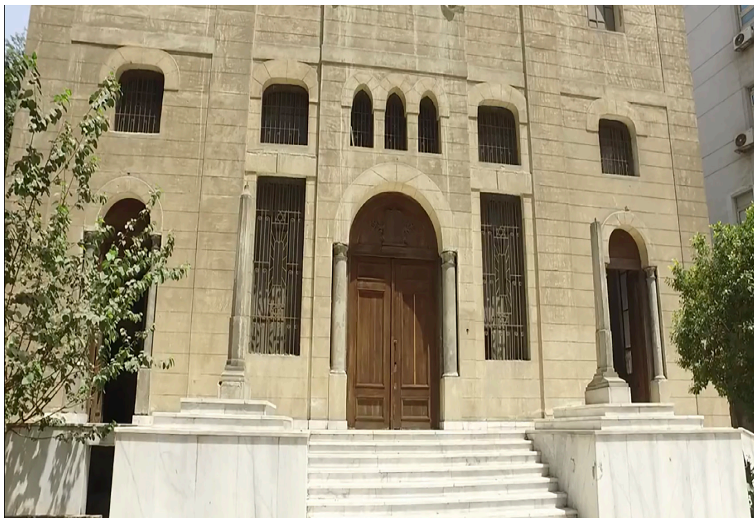
Fig. 4 - Moussa Dar'i façade, Cairo, Egypt. https://egypttours36.com/2020/09/22/lost-1000-year-old-hebrew-bible-found-on-dusty-cairo-synagogue-shelf/

1899, and was completed in 1904 (hsje.org ) (Fig. 1). Recent restoration was accomplished by the Supreme Council of Antiquities in 2007 (Standards-ica.com). It was built in Basilica layout (antiquities.gov.eg). The façade is representing the word “Akhet” with the solar disk at its center, inspired by ancient Egyptian temples façades. The façade also has bas reliefs of palm trees, which is a sacred plant in Judaism, as it was in ancient Egypt. According to one of the studies, by Hana Taragan, a professor at Tel Aviv University, that dealt with the analysis of this building it is one of several buildings built during the period of British rule in Egypt, and it combines various artistic styles—