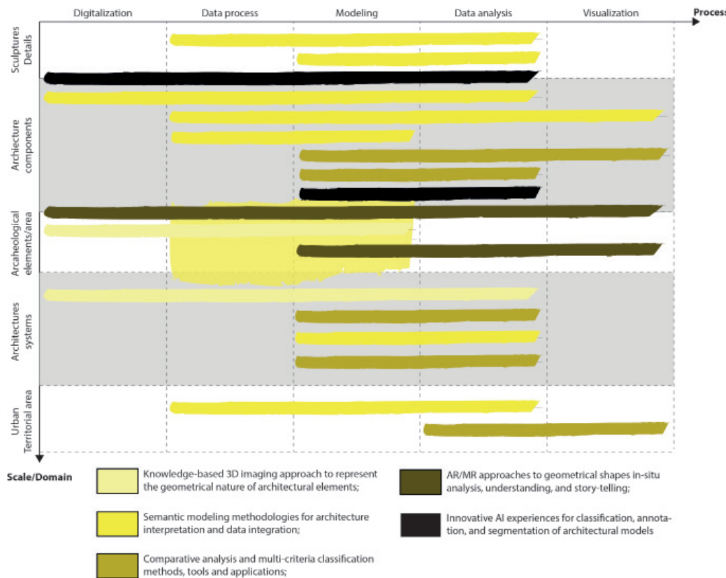
Fig. 3 - Paper distribution schema according to domain, scale, analysis process, and topic covered.

similarities, repetitions. The shapes recurrence, the research of similarities between different architectural signs, and the functional and formal dependence relationships highlight a clear hierarchical structure. It binds the overall system with its components, defining an order of reading. The scalability of this analytical approach, the interpretation, and the creation of new shapes allow understanding and suggest semantic-aware representation of decorative details, architectural